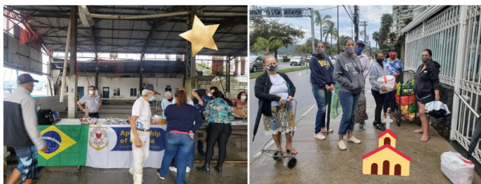
Artisan Fisher Women

The Stella Maris Santos continues to support fishers in the Baixada Santista region with the help of food baskets and hygiene kits. Approximately 150 families are being helped, including fishers and port workers. In addition to more than 1.000 kilos of food directed to various institutions that help drug addicts, indigenous communities and people with intellectual disabilities, as well as others in the public network.